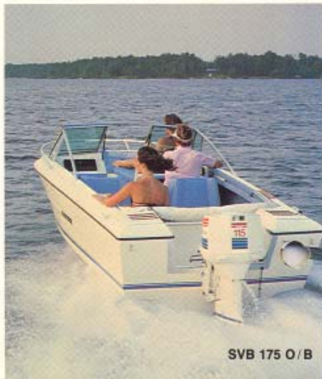
SVB 175 O/B