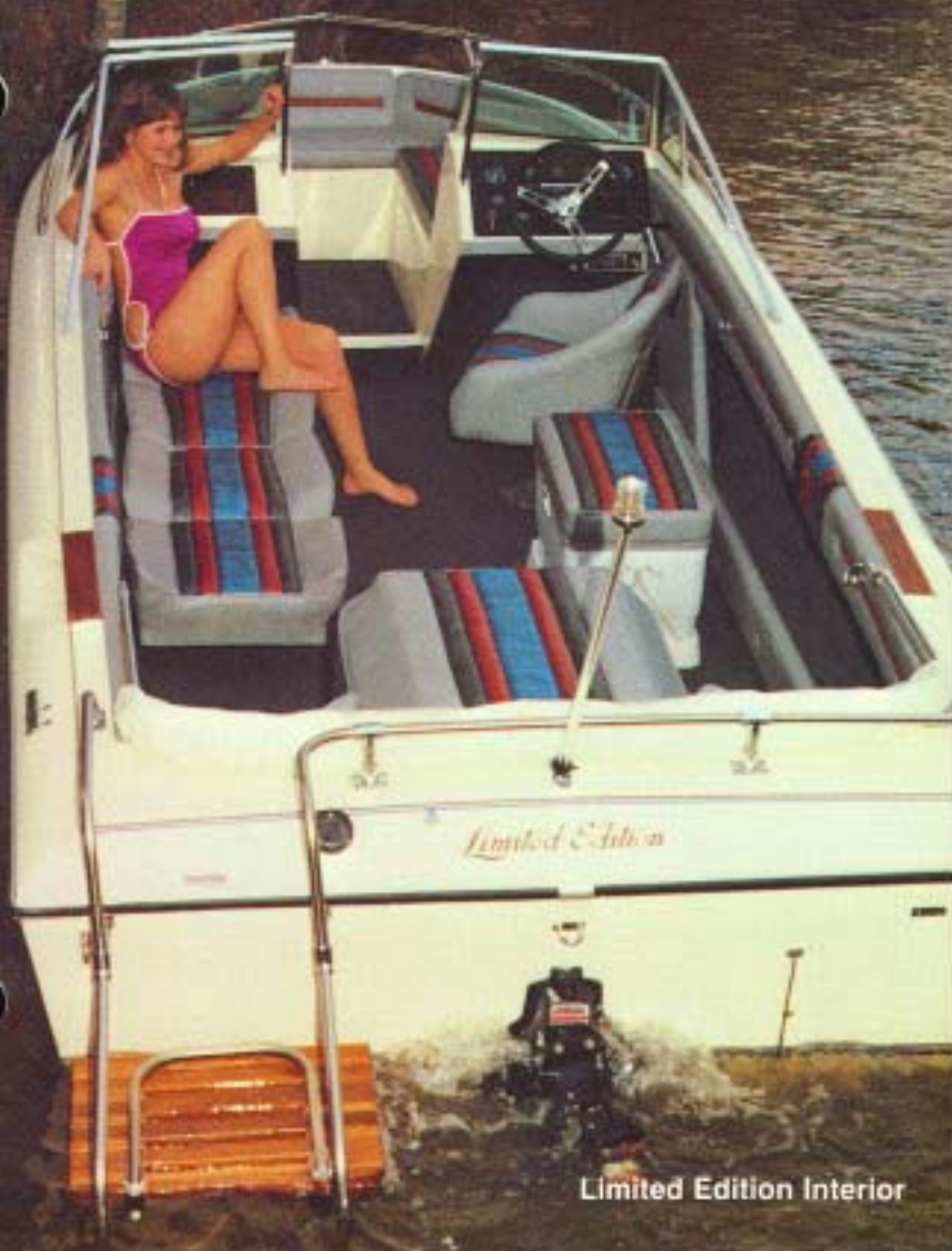
Limited Edition Interior

THE OPTIONAL INTERIOR PACKAGES SHOWN HERE ARE AVAILABLE ON ALL STERNDRIVE MODEL STINGRAYS