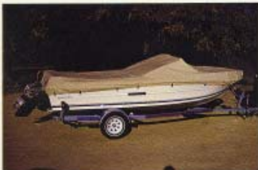
Custom Canvas Mooring Cover