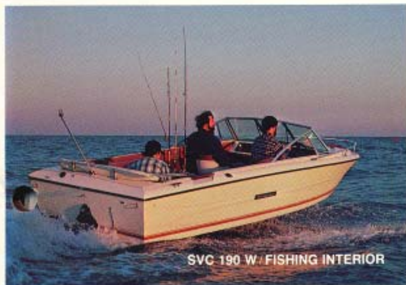
SVC 190 W. FISHING INTERIOR