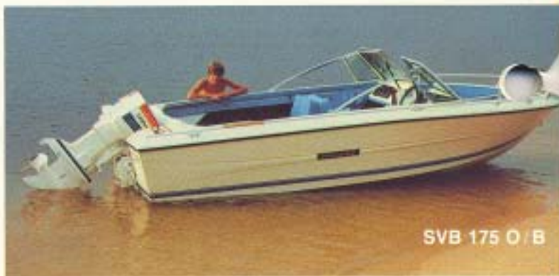
SVB 175 O/B