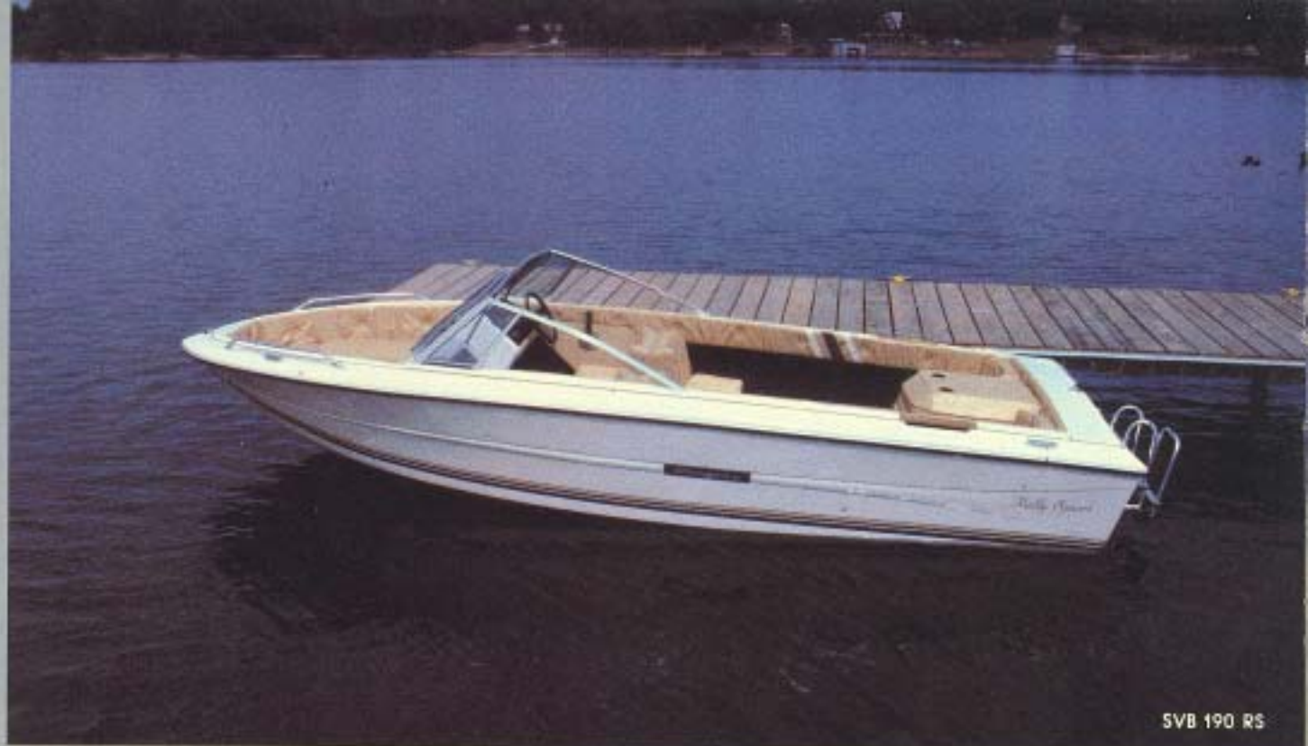
SVB 190 RS