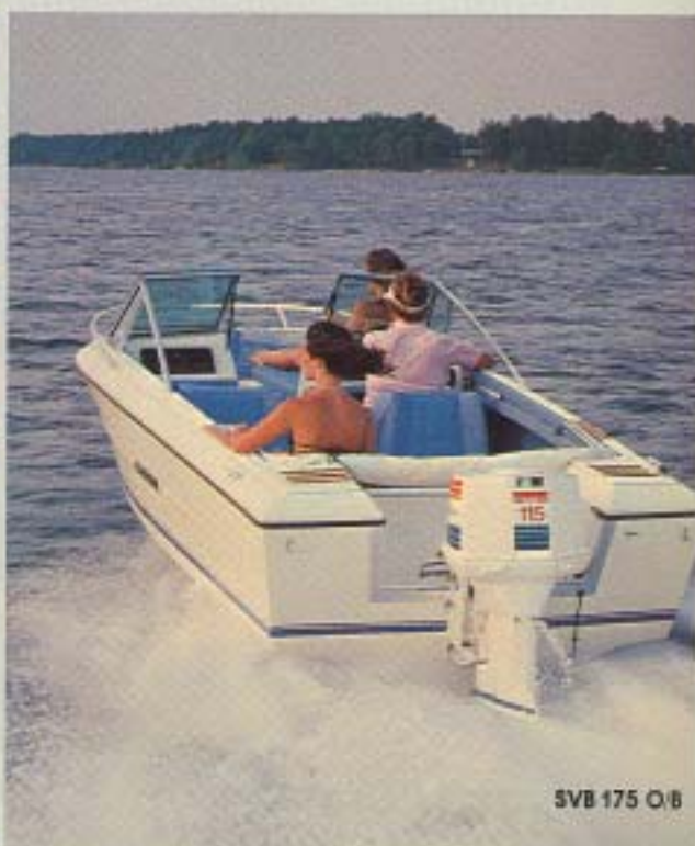
SVB 175 O/B