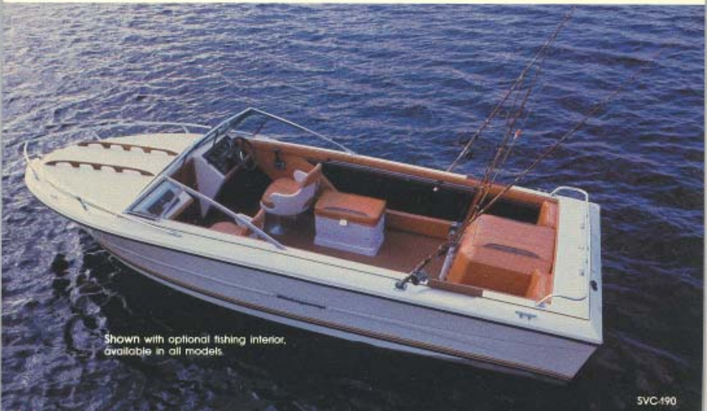
Shown with optional fishing interior, available in all models.