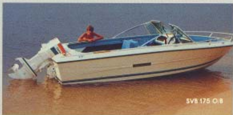
SVB 175 O/B