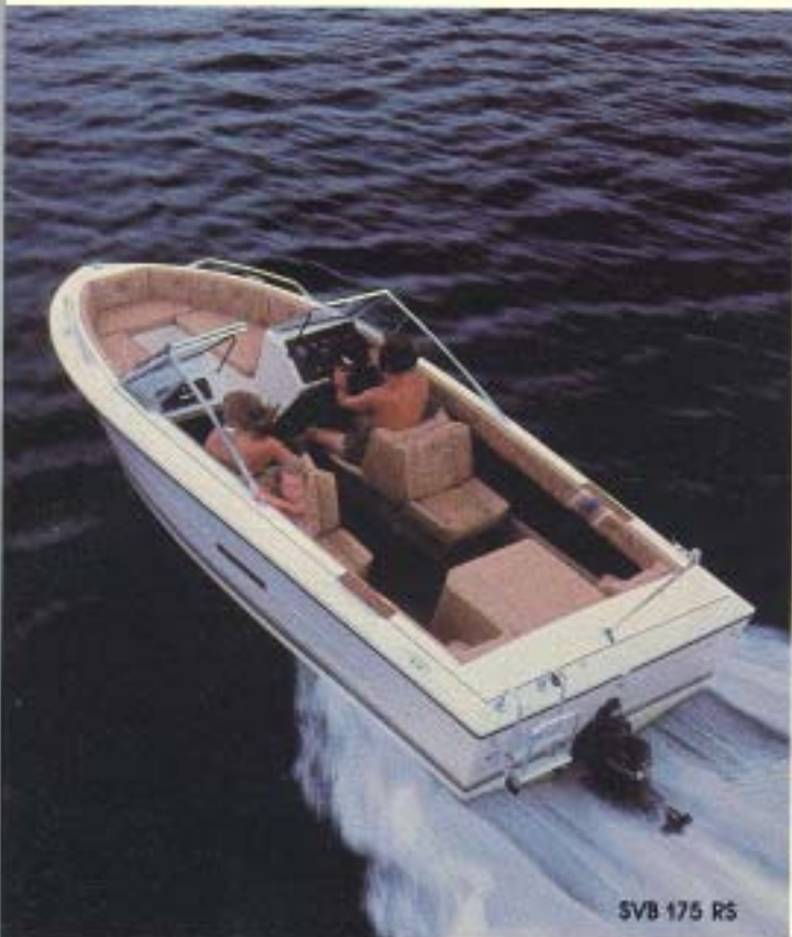
SVB 175 RS

It doesn't take long to find out what that new boat of yours is made of. One good run around the lake will tell you whether or not you've got Stingray performance and stability. One good tow with a couple of full sized skiers will tell you whether your boat has plenty of power and an efficient hull design. It only takes a day or two cruising with family and friends to let you know your boat has the features you need. Fold-down lounge seats, safe-T-steering, built-in fuel system, and a stern boarding ladder. And it only takes one look to tell you when a boat is really looking good. So take a good long look at all three of these economically priced boats. The SVB-190 , SVB-175 , or the SVB-165 . Either way, you're really looking good with Stingray's new economical Rally Series. Specifications on the Rally Series are the same as the Super Sport Series.