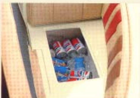
In Bow Insulated Ice Chest