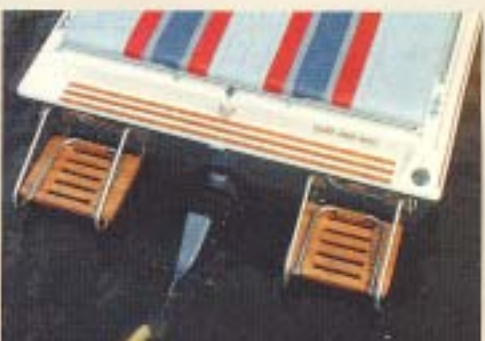
Twin Teak Swim Platforms