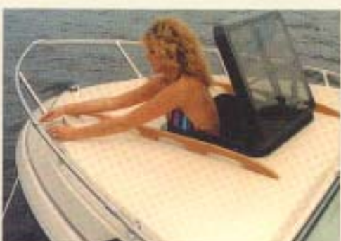
Translucent Deck Ventilation Hatch