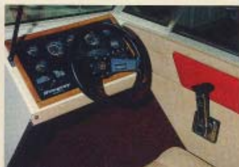
Fully Instrumented Dash, Soft Touch Steering Wheel, Power Trim & Tilt In Control Box Handle.