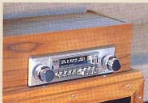
AM/FM Cassette Stereo System