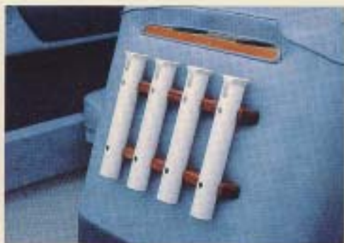
4-Pole Rod Ready Rack