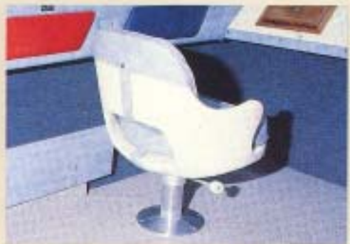
Roto Cast Seat w/Swivel & Slide