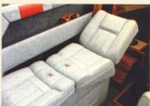
Sleeper Lounge Seats w/Headrest