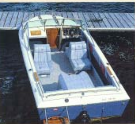
Family Fishing interior available on most models.