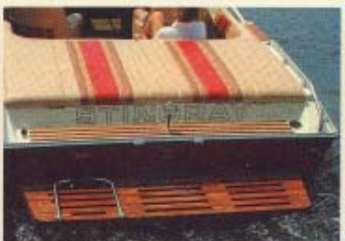
Full Width Teak Swim Platform