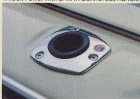
Gunwale Mounted Rod Holder