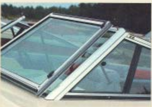
Tinted Safety Glass Windshield with Adjustable Side Vent Windows.