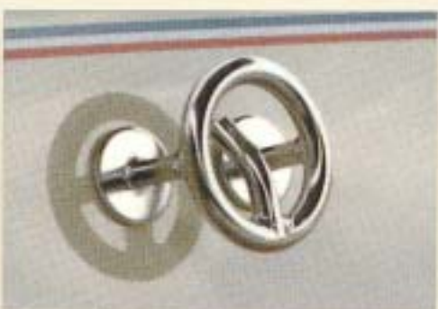
Stainless Steel Ski Tow Ring