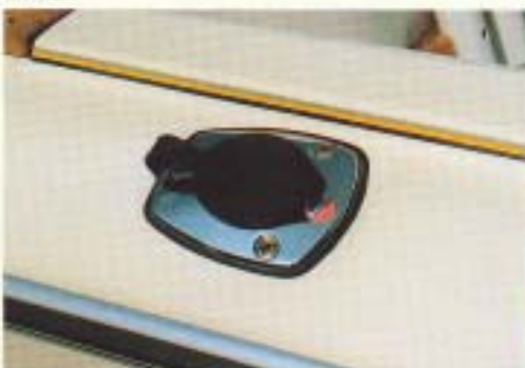
Gunwale Mounted Rod Holder