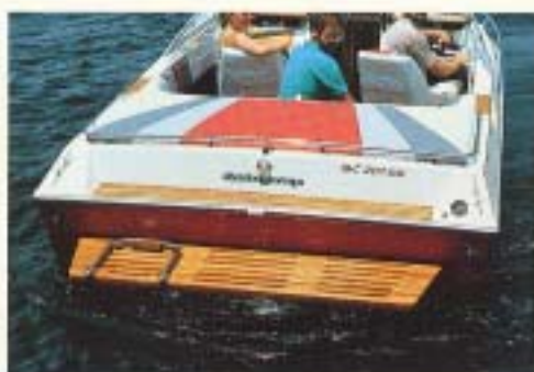
Full Width Teak Swim Platform