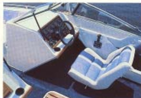
Fully Instrumented Dash, Soft Touch Steering Wheel, Roto-Cast Sport Bucket Seats