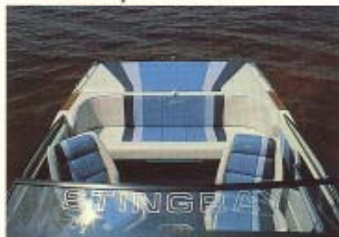
XLS Sundeck Interior