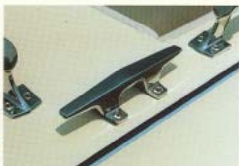
Quality marine hardware, Stainless Steel Rails