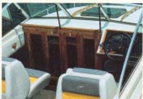
Teak and Smoked Plexiglass Double Bi-Fold Cabin Doors