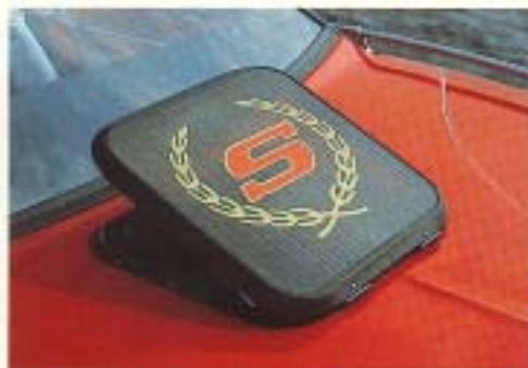
Translucent Deck Ventilation Hatch