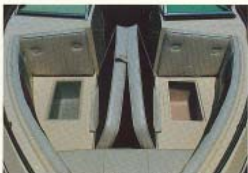
Bow Storage and Insulated Ice Chest