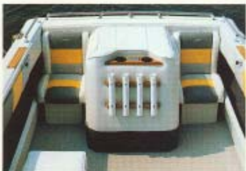
4 Pole Rod-Ready Rack