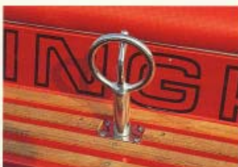
Stainless Steel Ski Pole