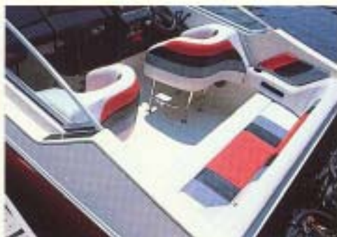
Offshore Drop-Bottom Bolster Seats