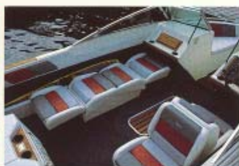
Back-To-Back Sleeper Lounge Seats