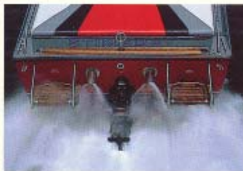
Twin Teak Swim Platforms