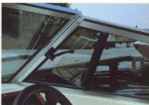
Tinted Safety Glass Windshield with Adjustable Side Vents