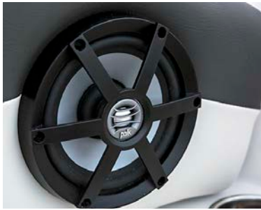
Polk Audio Systems (Options #730 - 500w and #731 - 200w)