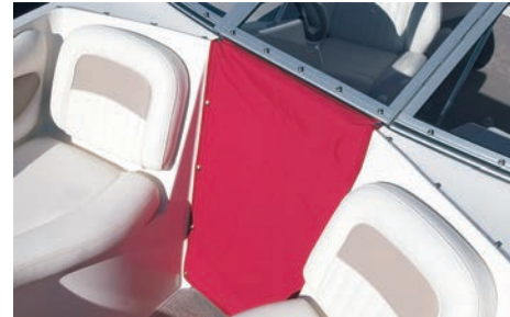
Walk-Thru Flap (shown in red) - Option #14