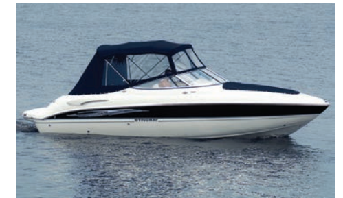
Full Canvas Set (shown in optional black) - Option #4