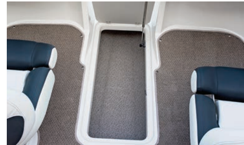
Carpeted Floor Storage with Non-Skid Lid and Stainless Steel Shock Assist