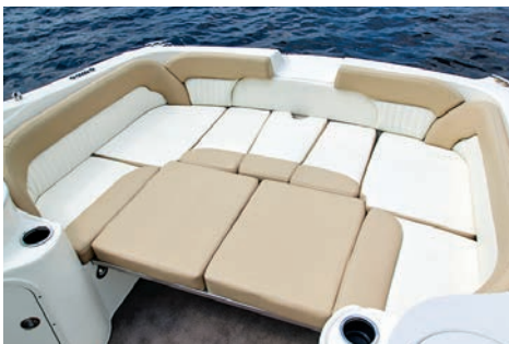
Cockpit Filler Cushions (250LR and 250CR)