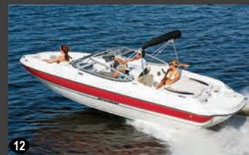
198RX RALLY BOAT