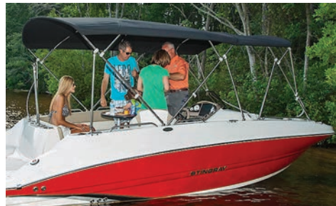
Stand-up Forward Bimini Top (shown in optional black) - Option #64 - attaches to front of the standard deck boat Stand-up Bimini Top (192SC shown)