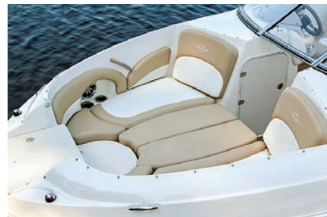
Bow Filler Cushions (Option #84)