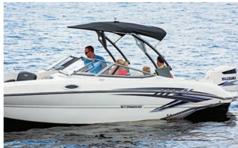
Wakeboard Tower Top (shown in optional black) - Option #63