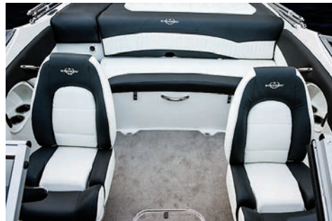
Onyx CoolTouch™ Vinyl Interior (no charge choice)