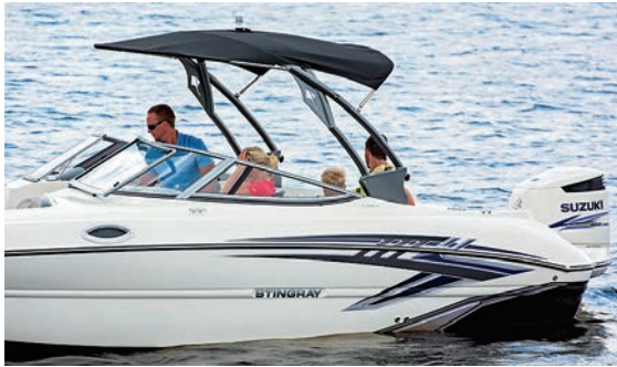
Wakeboard Tower, Folding Arch Style (Option #663) (includes Hyper Graphic) and Wakeboard Tower Top (Option #63)