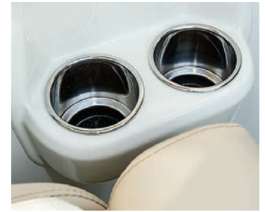
Stainless Steel Hardware Package (Option #820) Items vary by model. Refer to page 46 for complete package details.