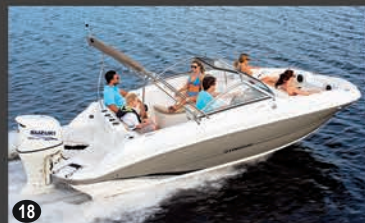
201DC DECK BOAT