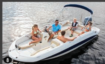
182SC DECK BOAT