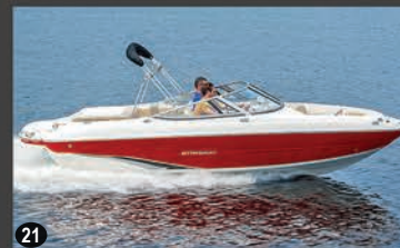
208LR SPORT DECK