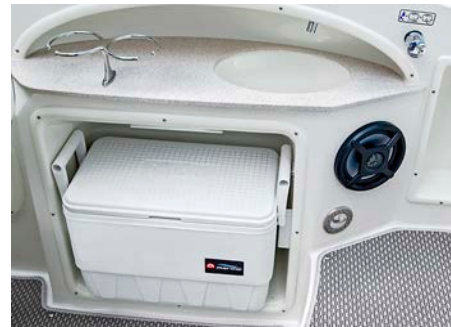
Freshwater Sink, Counter Top Area, and 25-quart Removable Cooler (235LR shown)