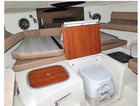
Molded Fiberglass Cabin Liner with Storage, Butane Stove, and Porta Potti (215CR shown)