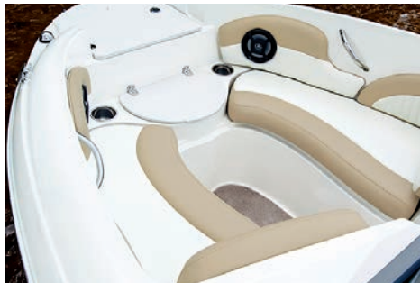
Tan Vinyl Interior