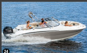
214LR SPORT DECK