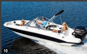
191DC DECK BOAT