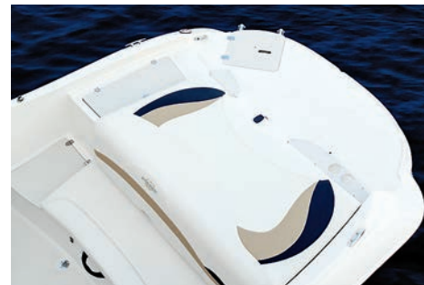
RX Interior - Bucket Seats, Bench Seating, & Sundeck