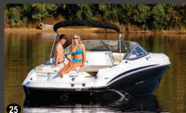
215LR SPORT DECK