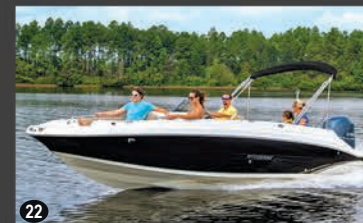
212SC DECK BOAT