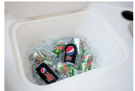
Bow Ice Chest (sizes and styles vary)