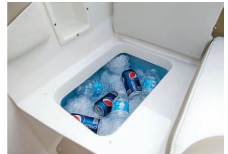
Ice Chest Under Walk-Thru Step (varies by model)