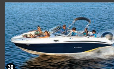
234LR SPORT DECK