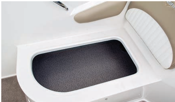
Under Seat Storage (varies by model)