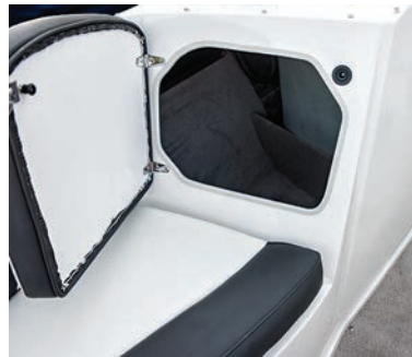
Under Seat Storage (varies by model)