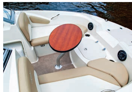
Cockpit Table with Floor Mount (Option #76)