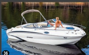
215CR SPORT DECK CUDDY