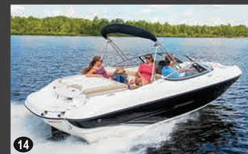
198LX SPORT BOAT