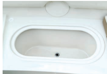
Fish Storage Box / Cooler