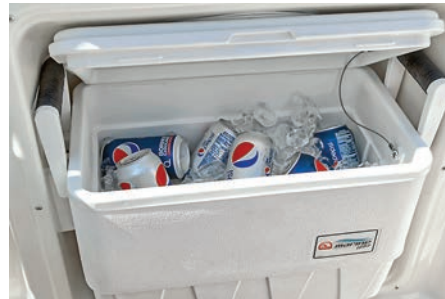
25-quart Removable Cooler