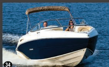
250LR SPORT BOAT