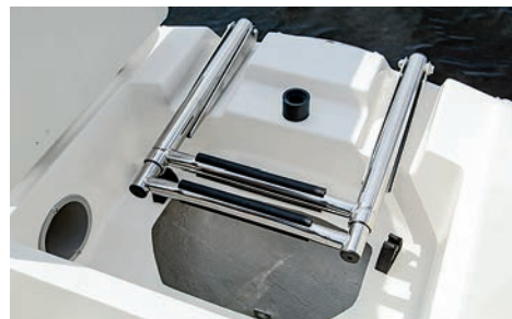
Slide-out Bow Ladder, Fender Storage, and Anchor Storage (Sport Deck Bowrider Models)