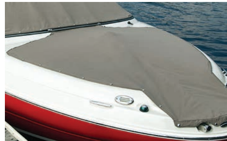
Bow Cover (shown in standard latte) - Option #18