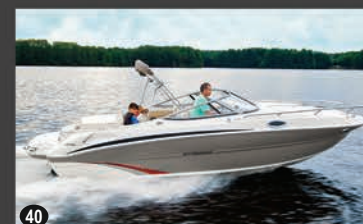
235CR SPORT DECK CUDDY