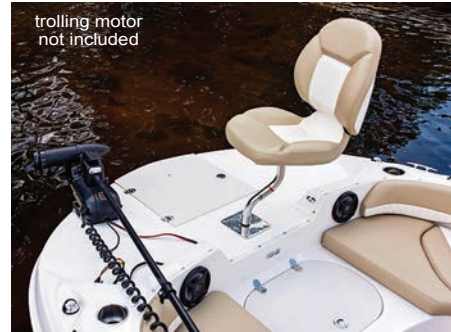
Fishing Package (Option #802) Items vary by model. Refer to page 46 for complete package details.