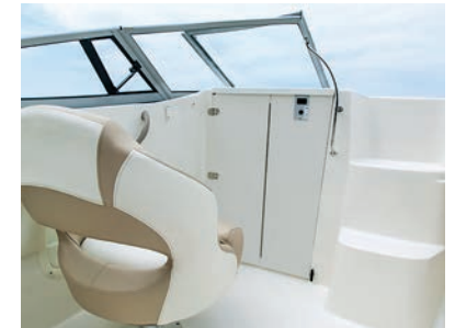
Integrated Bow Steps and Lockable Cabin Door (215CR shown)