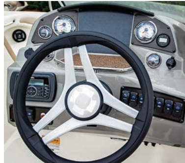
Custom Steering Wheel (style varies by model)