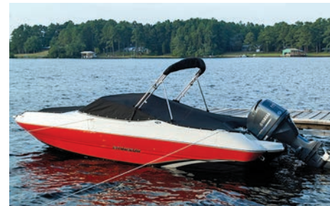
Cockpit and Bow Cover (shown in optional black) - Option #17