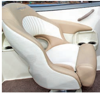
Sport Bucket with Flip-Up Bolster