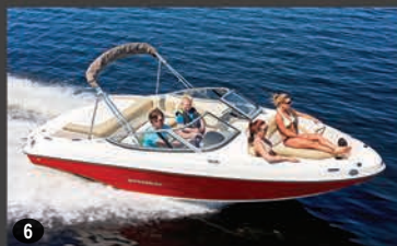
188LX SPORT BOAT