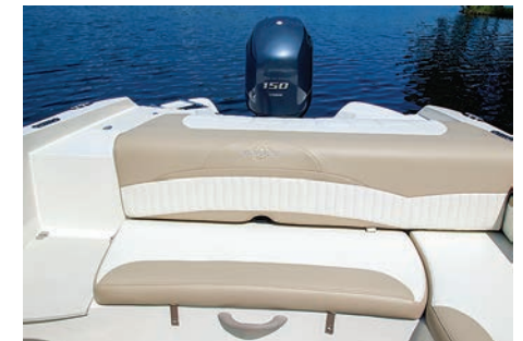
Sport Deck Interior (outboard) - Bucket Seats, Wrap-around Seating, & Sundeck