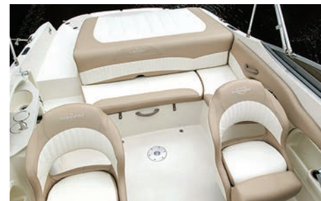
Sport Deck Interior (sterndrive) - Bucket Seats, Wrap-around Seating, & Sundeck