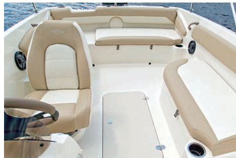
Deck Boat Interior - Sport Bucket, Open Layout, and Lots of Seating