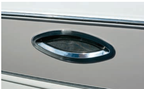
Stainless Steel Port Windows