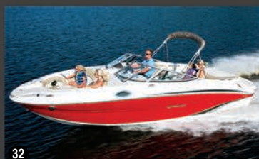
235LR SPORT DECK