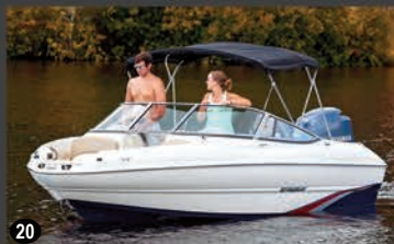
204LR SPORT DECK