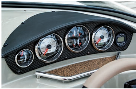
Custom Dash with Backlit Instruments and Stainless Steel Accents