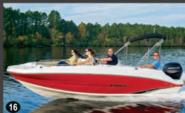
192SC DECK BOAT