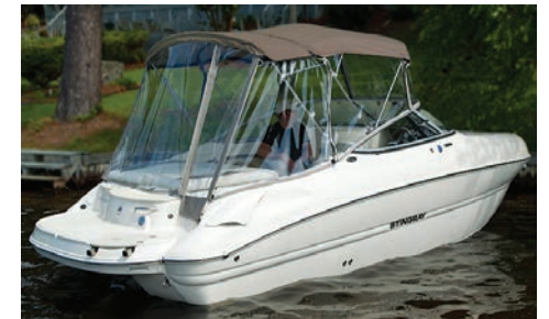
Camper Canvas (shown in standard latte) (215LR shown) - Option #15