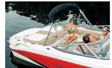
225 Models Interior - Bucket Seats, Wrap-around Bench Seating, & Center Walk-Thru Sundeck