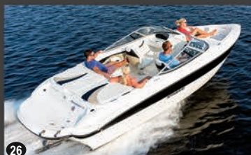
225RX RALLY BOAT