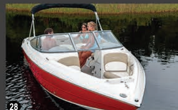
225LR SPORT BOAT