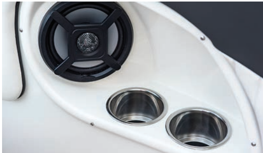
Recessed Speakers and Convenient Stainless Steel Drink Holders