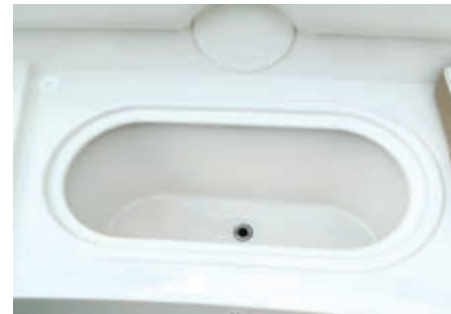
Fish Storage Box / Cooler