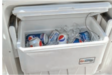
25-quart Removable Cooler