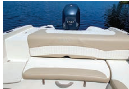
Sport Deck Interior (outboard) - Bucket Seats, Wrap-around Seating, & Sundeck