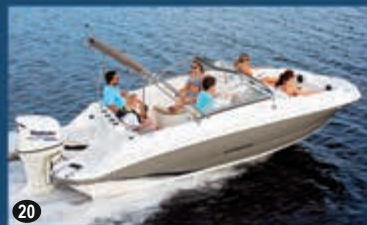
201DC DECK BOAT