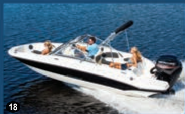
191DC DECK BOAT