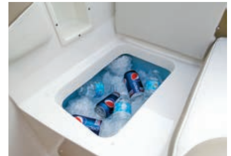
Ice Chest Under Walk-Thru Step (varies by model)