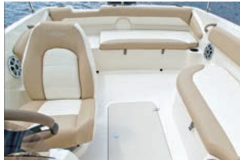
Deck Boat Interior - Sport Bucket, Open Layout, and Lots of Seating