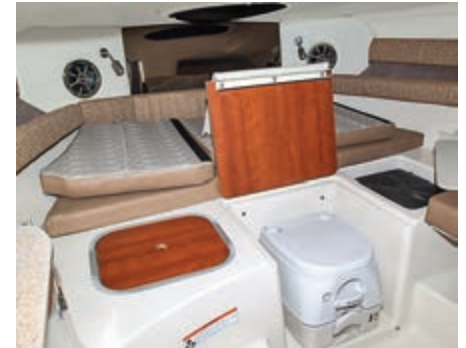
Molded Fiberglass Cabin Liner with Storage, Butane Stove, and Porta Potti (215CR shown)