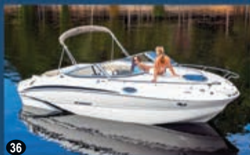
215CR SPORT DECK CUDDY