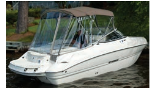
Camper Canvas (shown in standard latte) (215LR shown) - Option #15