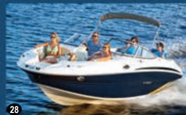
234LR SPORT DECK