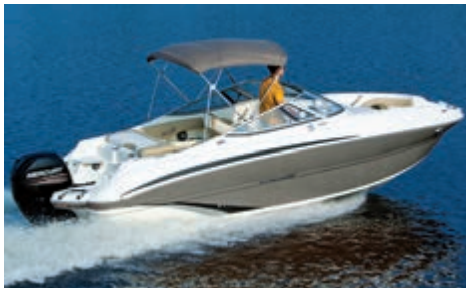
Bimini Top (shown in standard latte) with Windshield Connector (not shown) - Option #65

Prices and specifications subject to change. Only the most popular standard and optional equipment items are shown. For the current and complete list of items, visit stingrayboats.com/options