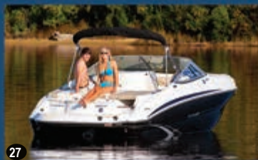
215LR SPORT DECK