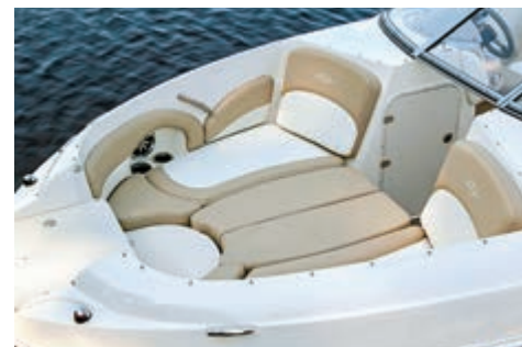
Bow Filler Cushions (Option #84)