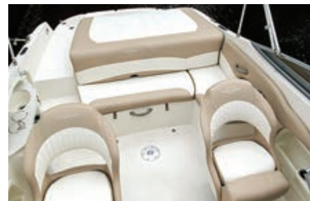
Sport Deck Interior (sterndrive) - Bucket Seats, Wrap-around Seating, & Sundeck