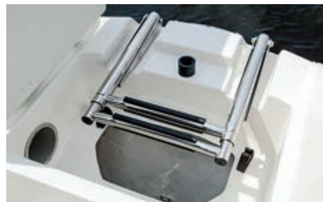
Slide-out Bow Ladder, Fender Storage, and Anchor Storage (Sport Deck Models)