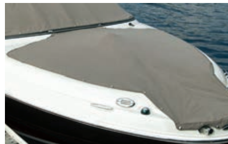
Bow Cover (shown in standard latte) - Option #18