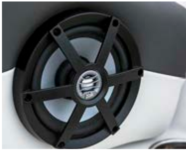
Polk Audio Systems (Options #730 - 500w and #731 - 200w)