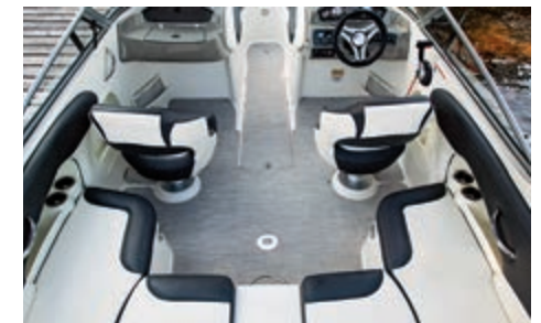
225 Models Interior - Bucket Seats, Wrap-around Bench Seating, & Center Walk-Thru Sundeck