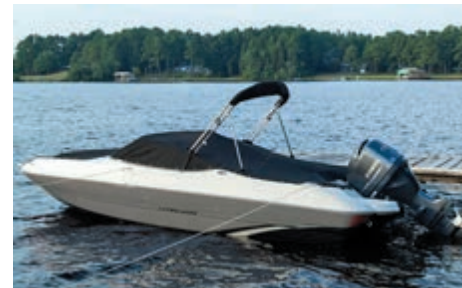
Cockpit and Bow Cover (shown in optional black) - Option #17