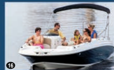
212SC DECK BOAT