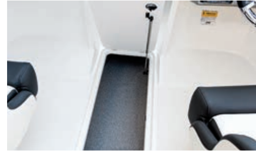
Carpeted Floor Storage with Non-Skid Lid and Stainless Steel Shock Assist