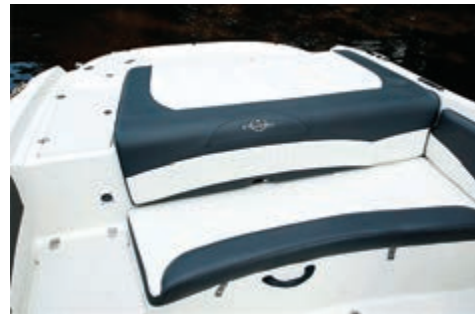
Onyx CoolTouch™ Vinyl Interior (no charge choice)