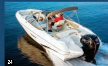
204LR SPORT DECK