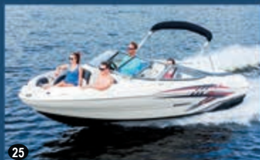
208LR SPORT DECK