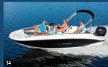
192SC DECK BOAT