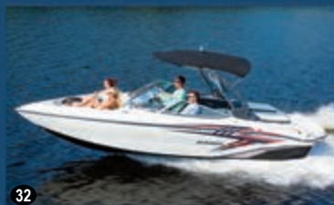
225LR SPORT BOAT