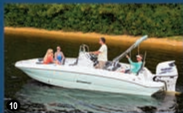
206CC DECK BOAT