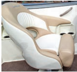
Sport Bucket with Flip-Up Bolster