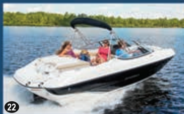
198LX SPORT DECK