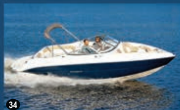
250LR SPORT BOAT