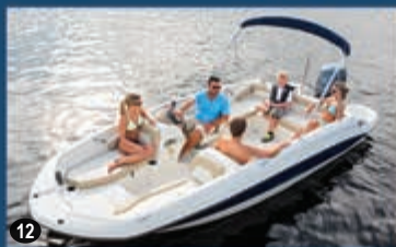
182SC DECK BOAT