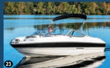
198LS SPORT DECK