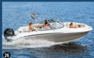
214LR SPORT DECK