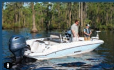
186CC DECK BOAT