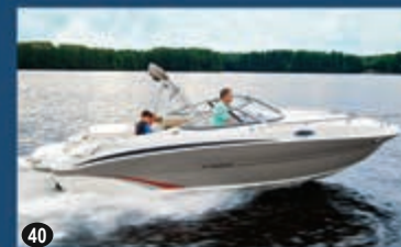
235CR SPORT DECK CUDDY