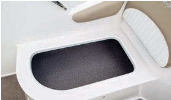
Under Seat Storage (varies by model)