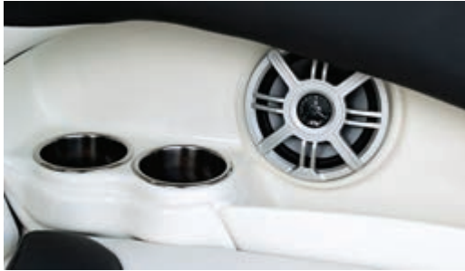
Recessed Speakers and Convenient Stainless Steel Drink Holders