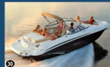
235LR SPORT DECK