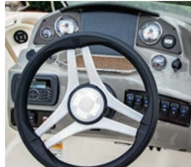
Custom Steering Wheel (style varies by model)