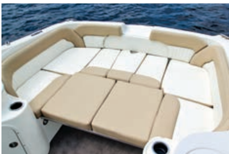
Cockpit Filler Cushions (250LR and 250CR)