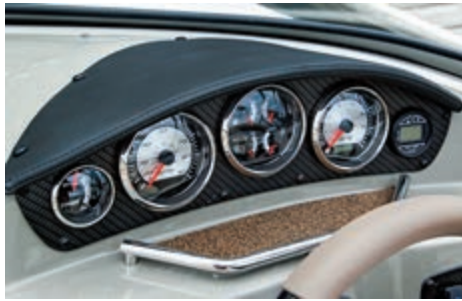
Custom Dash with Backlit Instruments and Stainless Steel Accents