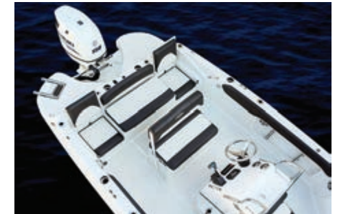
Center Console Deck Boat Interior - Captain's Bench w/ Flip-Flop Leaning Post, Rear Bench, & Flip-Up Seats