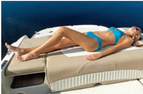
Walk-Thru Removable Filler Cushion (Option #47 or #77)