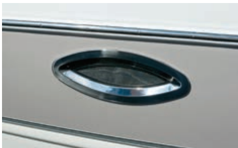
Stainless Steel Port Windows