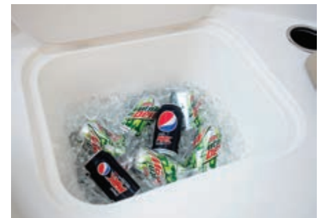
Bow Ice Chest (sizes and styles vary)