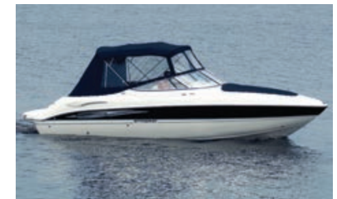
Full Canvas Set (shown in optional black) - Option #4