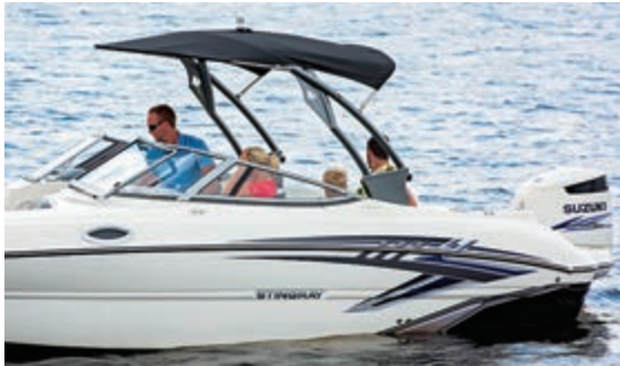
Wakeboard Tower, Folding Arch Style (Option #663) (includes Hyper Graphic) and Wakeboard Tower Top (Option #63)