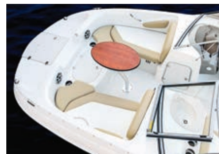
Cockpit Table with Floor Mount (Option #76)