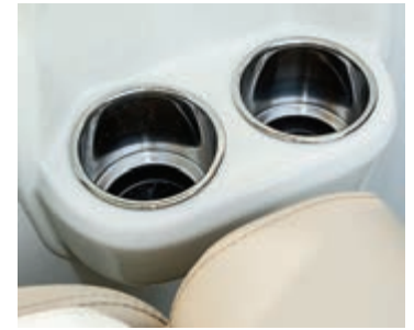
Stainless Steel Hardware Package (Option #820) Items vary by model. Refer to page 46 for complete package details.