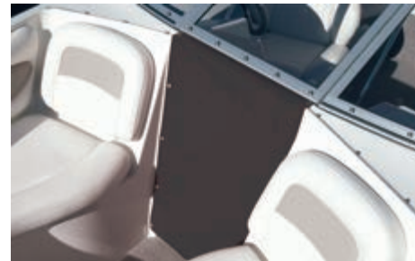
Walk-Thru Flap (shown in optional black) - Option #14