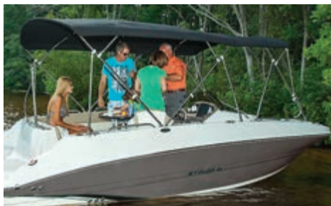
Stand-up Forward Bimini Top (shown in optional black) - Option #64 - attaches to front of the standard deck boat Stand-up Bimini Top (192SC shown)