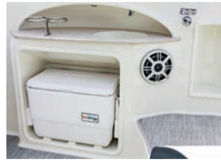
Freshwater Sink, Counter Top Area, and 25-quart Removable Cooler (235LR shown)