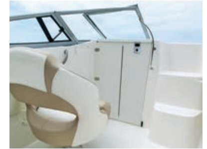
Integrated Bow Steps and Lockable Cabin Door (215CR shown)