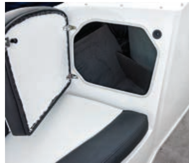
Under Seat Storage (varies by model)