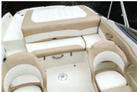
Tan Vinyl Interior