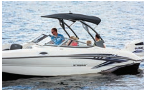
Wakeboard Tower Top (shown in optional black) - Option #63